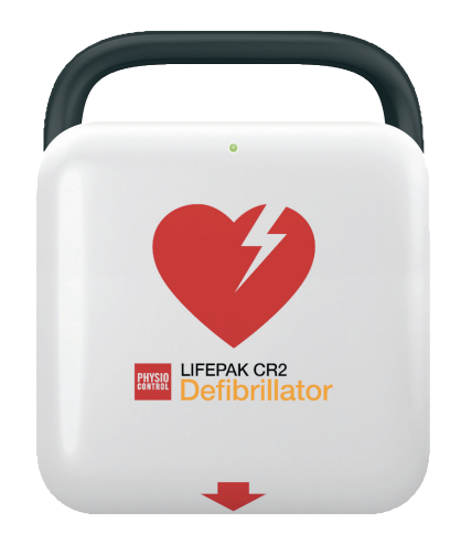
Lifepak CR2 Semi-Automatic